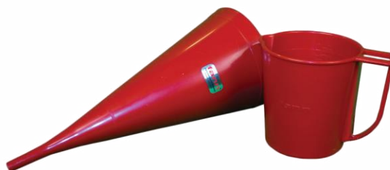
No. 201 Marsh Funnel and No. 202 Measuring Cup