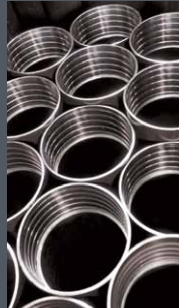
Rods and Casing