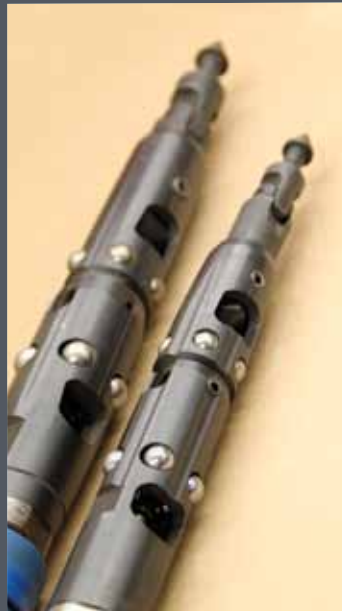
Genuine Q™ Wireline Tooling